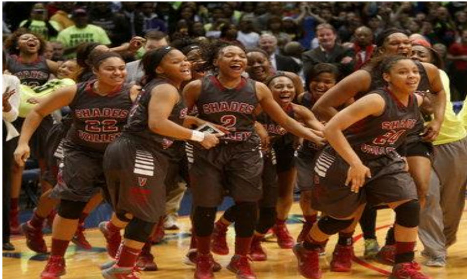
The 2013 Alabama State Champions -Shades Valley High Girls Basketball Team